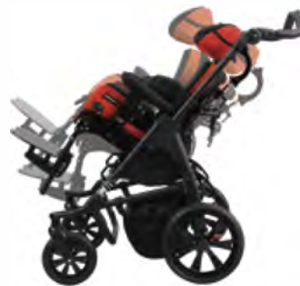
Adjustable recline, seat tilt and elevating foot support.