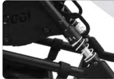
Adjustable suspension system.