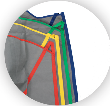
Clear coloured binding tape identifies sling size.