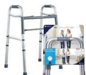
Aluminium Side Folding Walking Frame WAF710100 Frame, Wheels & Skis - 540mm WAF710100A