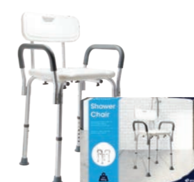
Homecare Shower Chair BTS118025