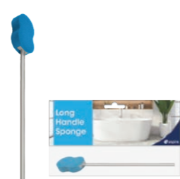
Bath Sponge Plastic Handle BTS111100