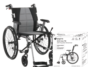
Socialite Folding Wheelchair Self Propelled Silver MWS449820 Red MWS449830