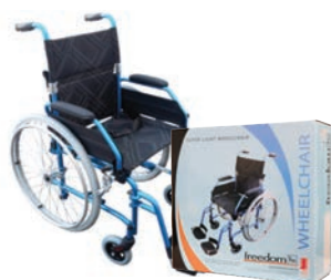
Freedom Excel Superlite Wheelchair Self Propelled 460mm MWS452170 510mm MWS452180