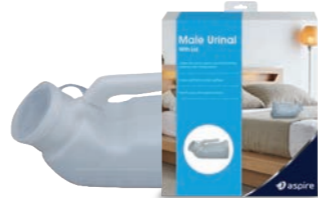
Male Urinal with Lid BTT148450