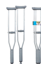
Wing Nut Underarm Crutches Youth/Small WAC692503 Adult/Medium WAC692502 Adult Tall/Large WAC692501