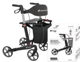
Vogue Carbon Fibre Seat Walker Standard WAF705350 Tall WAF705360