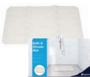
Bath & Shower Mats 340 x 580mm BTS110200 530 x 530mm BTS109600