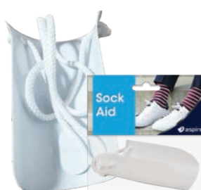
Stocking / Sock Aid DLD269275