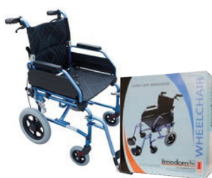
Freedom Excel Superlite Transporter Wheelchair Attendant Propelled 460mm MWS452110 510mm MWS452120