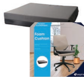
Multi Purpose Cushion GSS340120