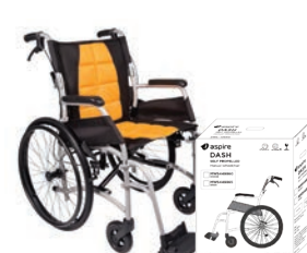
Dash Folding Wheelchair Self Propelled Orange MWS449860 Green MWS449865