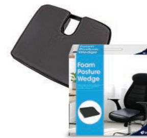
Aspire Foam Posture Wedge GSS340215