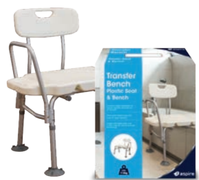
Transfer Bench Plastic Seat & Bench Plastic Seat BTS108200 Padded Seat BTS109000 Heavy Duty BTS105300

Aspire's new retail box range combines industry leading product with eye catching packaging. The Aspire products come packaged in convenient packets or cardboard boxes with carry handles, they are easy to assemble and come with a minimum one-year warranty.