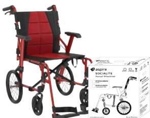
Socialite Folding Wheelchair Attendant Propelled Silver MWS449800 Red MWS449810