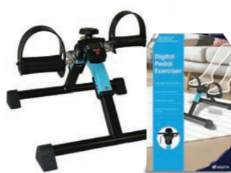
Digital Pedal Exerciser FPP292810