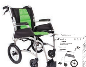
Dash Folding Wheelchair Attendant Propelled Orange MWS449850 Green MWS449855