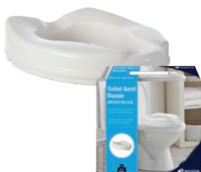
Toilet Seat Raiser without Lid 50mm BTT150200 100mm BTT150300 150mm BTT150400