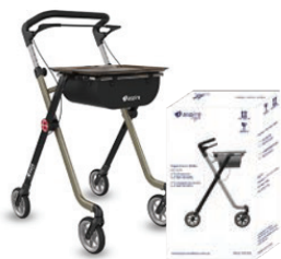
Vogue Indoor Walker Champagne/Black WAF705100CH Red/Black WAF705100RE