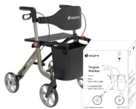
Vogue Lightweight 2 Seat Walker Champagne WAF705310CH Red WAF705310RE