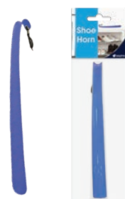
Shoe Horn DLD269160