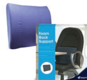
Foam Back Support GSS340140