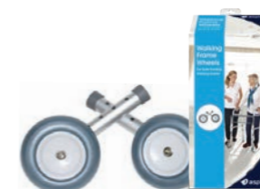
Walking Frame Wheels Pair WAA686560