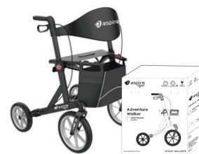
Vogue Adventure Walker WAF705450