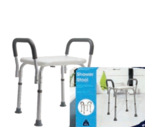
Homecare Shower Stool BTS119035