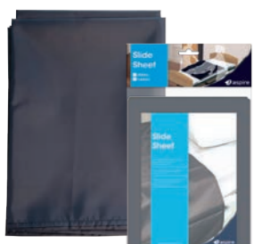
Slide Sheet Small TSE673070 Large TSE673080