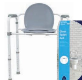
Homecare Over Toilet Aid BTT145025