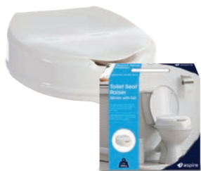
Toilet Seat Raiser with Lid 50mm BTT149900 100mm BTT150100 150mm BTT150400