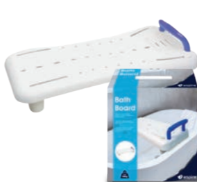
Bath Board BTS113700