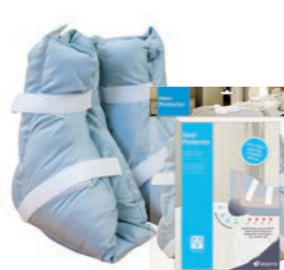
Heel Protectors PTA503360