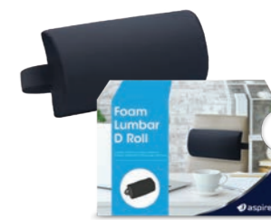
Lumbar Roll Cushion GSS340240