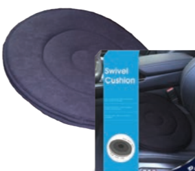
Swivel Cushion TSE673056