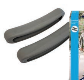
Crutch Accessories Underarm Cushion WAA686240 Padded Hand Grip WAA686250