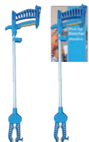
Pick Up Reacher Standard DLR279150 Long DLR279170 Extra Long DLR279230