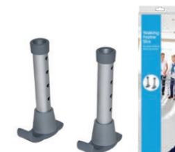
Walking Frame Ski's WAA686550