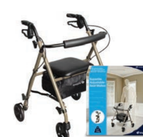
Superlite Adjustable Seat Walker WAF709650CH